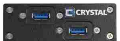
2x USB 3.0