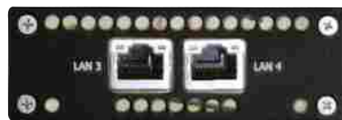
2-port GbE LAN