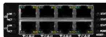
8-port GbE switch