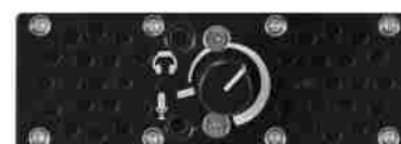
USB audio device with speakers