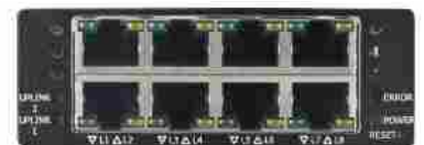
16-port GbE switch