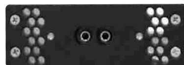
USB sound card