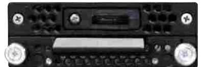
CMOS battery tray